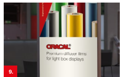
Example 9 ORACAL® 8830