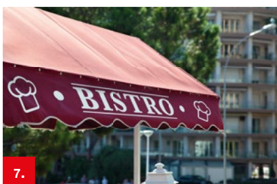
Example 7 ORACAL® 451

The typical use of the new diffuser films is application inside light box displays, where they will ensure evenly distribution of the light, as well as prevent unwanted external visibility of the internal light sources. They provide an easy means of getting a perfect finished look to any internally lit display, and are designed for use with both LED and general light sources. The materials come in two different light transmission grades.