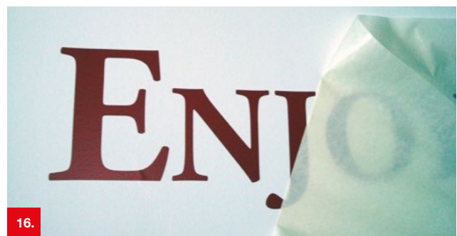
Example 16 ORATAPE® LT52