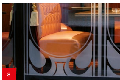
Example 8 ORACAL® 8810