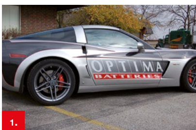
Example 1 ORACAL® 951

Designed for short and medium-term applications, this CAD/CAM vinyl can be used both indoors and outdoors. Its versatility and a range of 59 vivid colours with glossy finish and 56 colours in a matt finish makes it a perfect match for a wide range of decorative works. It displays an excellent degree of opaqueness and comes with a permanent solvent polyacrylate adhesive to allow for an outdoor durability of up to 5 years.