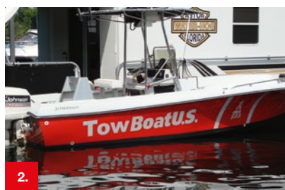
Example 2 ORACAL® 751C