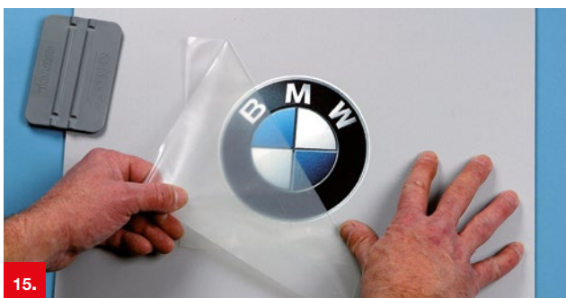
Example 15 ORATAPE® MT95

ORAFOL has developed application materials for a great variety of demands and uses.