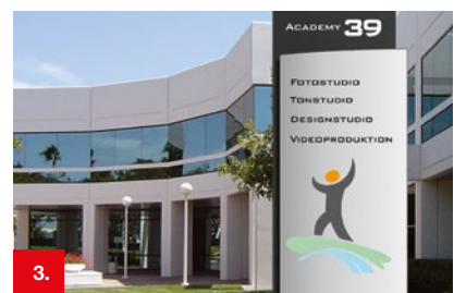
Example 3 ORACAL® 551