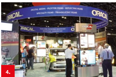
Example 4 ORACAL® 631

This plotter film is constructed specifically for use on banners, ribbons and other flexible surfaces. It adapts well to any surface, remains stable even under demanding conditions and may be easily removed without any trace. Possibilities are endless with a colour range of no less than 23 standard options.