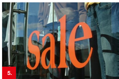
Example 5 ORACAL® 641